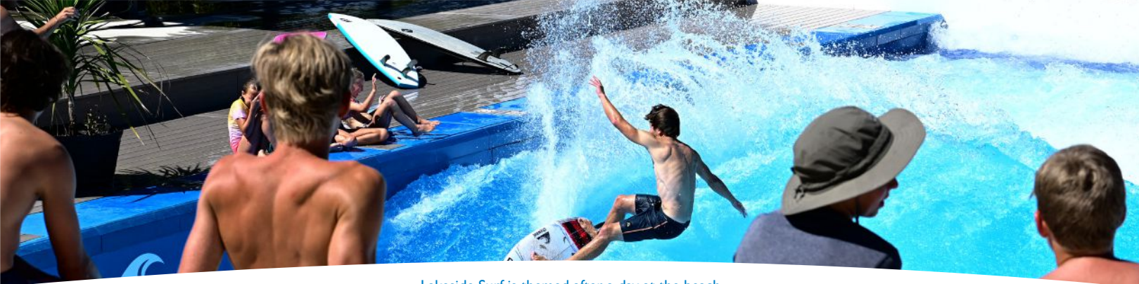
Lakeside Surf is themed after a day at the beach.